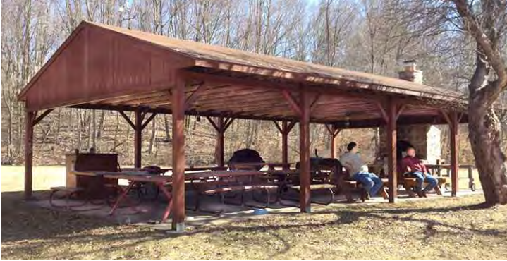
White Haven Sportsmen's Club Outdoor Pavilion in March