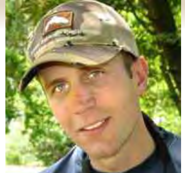
DEMONSTRATION BY RENOWNED CASTING CHAMPION AND AUTHOR GEORGE DANIEL

White Haven Sportsmen's Club picnic grounds located alongside the beautiful Upper Lehigh River